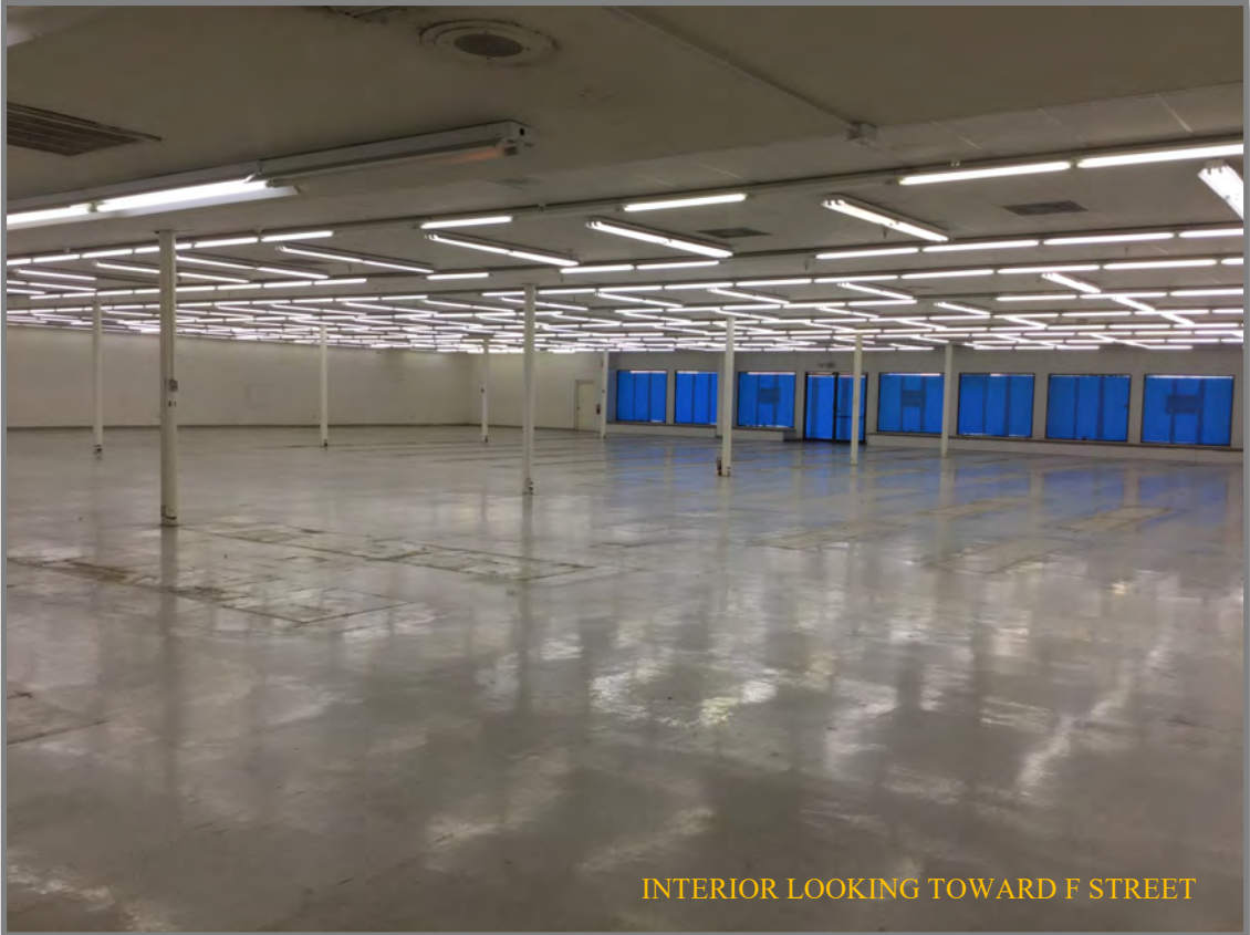
INTERIOR LOOKING TOWARD F STREET