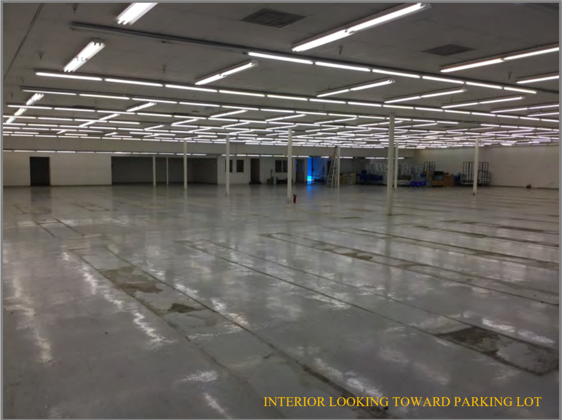
INTERIOR LOOKING TOWARD PARKING LOT